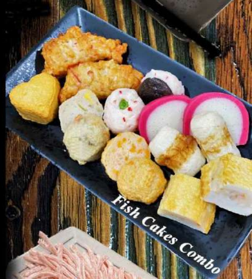
Fish Cakes Combo