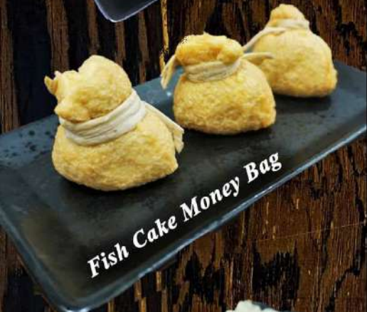
Fish Cake Money Bag