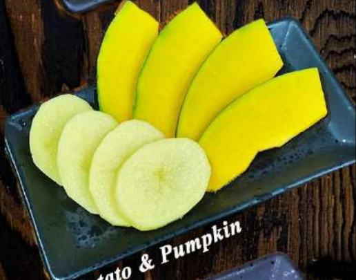
Potato & Pumpkin